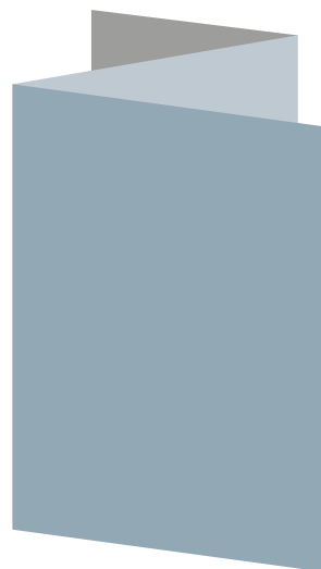
A4 to DL 6pp 'Z' Fold